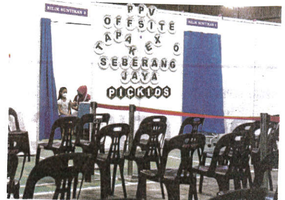
The empty waiting hall at the Seberang Jaya Expo vaccine delivery centre in Penang yesterday.